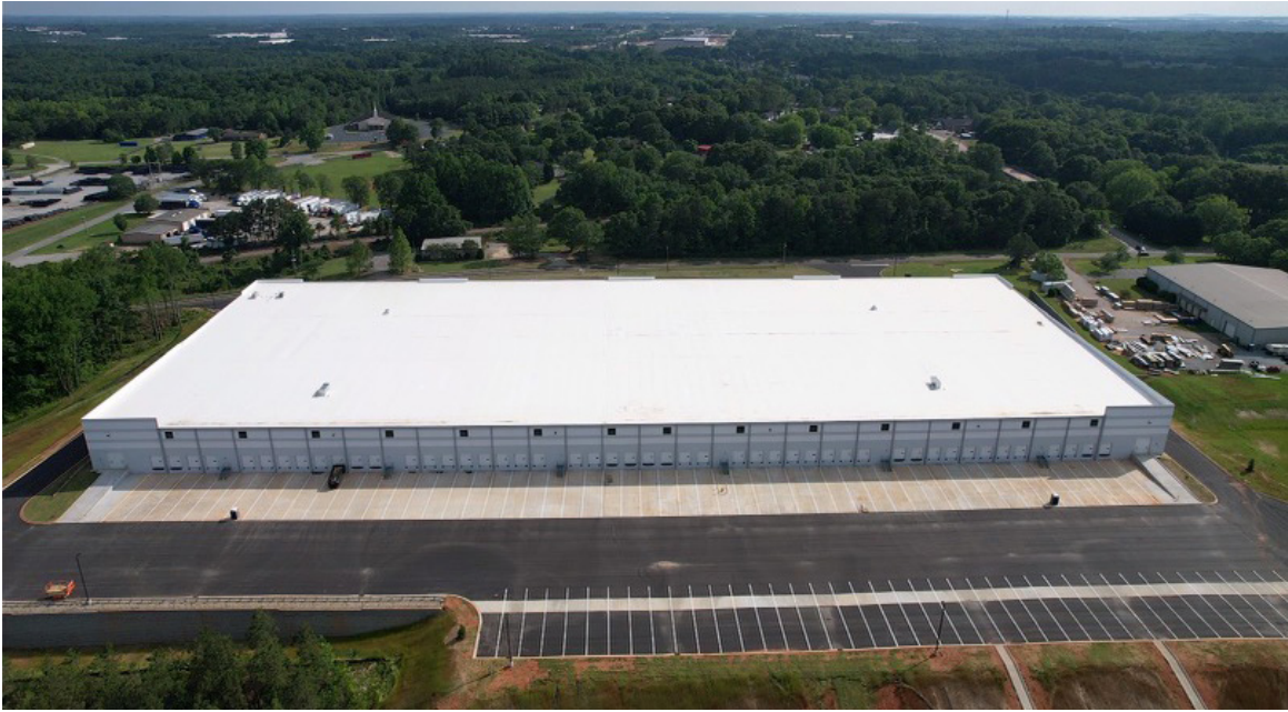
Gateway 29 | Wellford, South Carolina